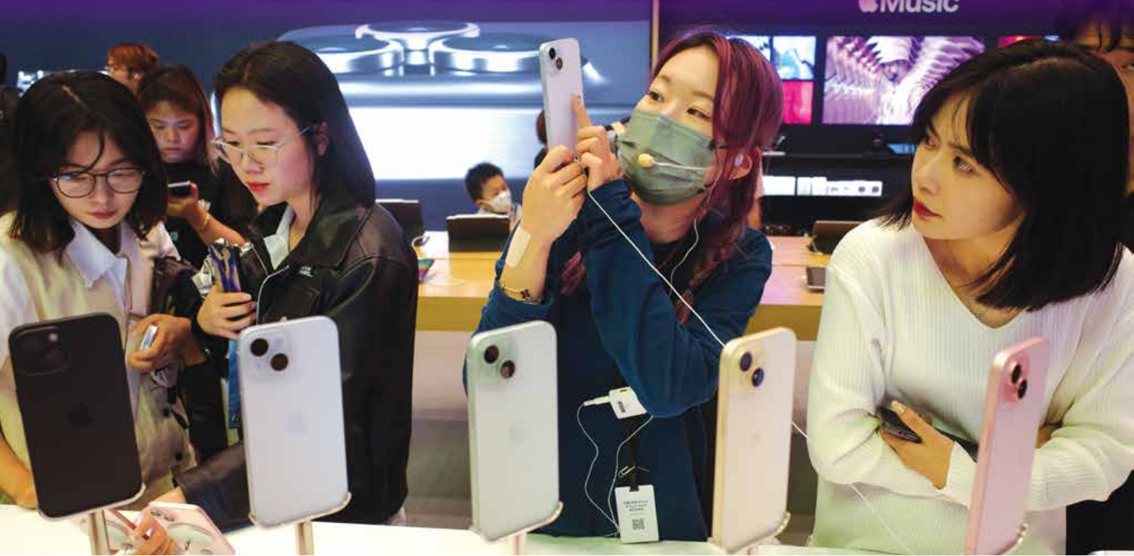
Shoppers browse at an Apple Store in Shanghai, China. Many of the goods you shop for and use everyday are manufactured either partially or wholly in China.

Look carefully at the packaging your iPhone came in. The fine print reads: “Designed by Apple in California. Assembled in China.” Every year, hundreds of millions of iPhones are sold in the US and around the world . While its design and software hail from Apple’s headquarters in Cupertino, California, the device’s assembly takes place thousands of miles away in China. More than just a manufacturing label, this phrase captures the story of two economic superpowers that are highly dependent on each other in the current globalized economy.