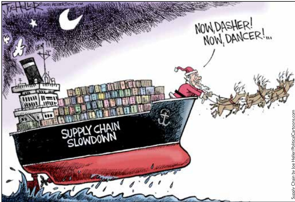
Supply Chain